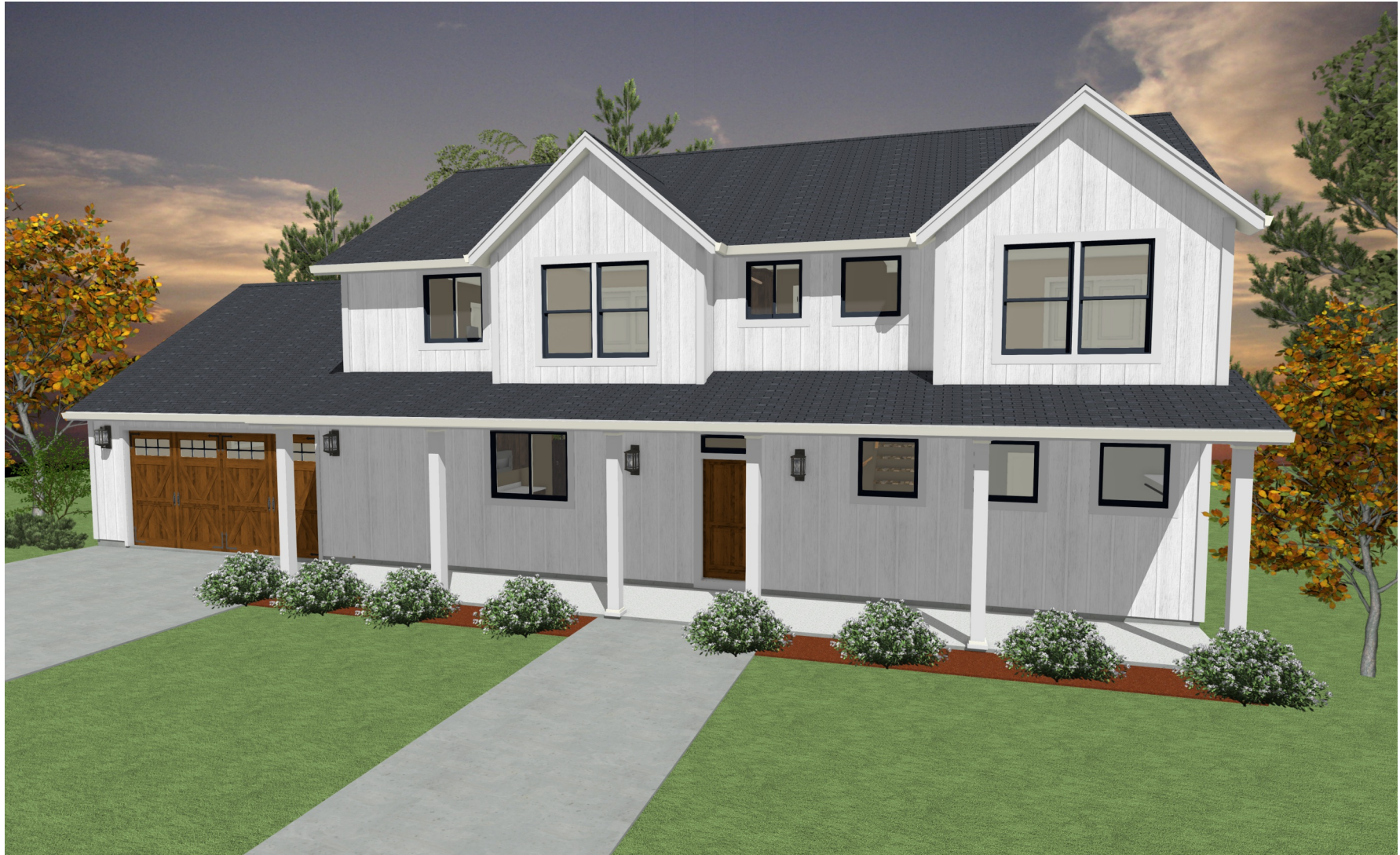
FRONT PERSPECTIVE VIEW

JOB#19-157 SQ. FT. 2693 CLIENT: SCHRIENER DATE: 1/21/2020