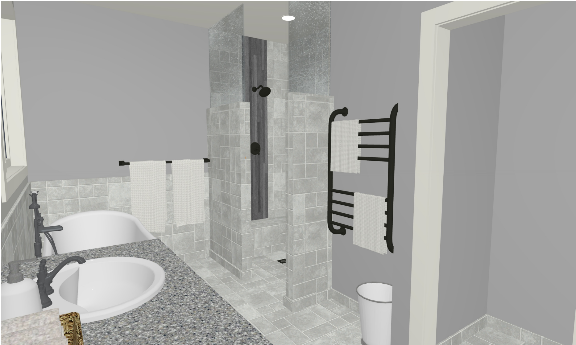
M BATH 2

JOB#20-013 SQ. FT: 2654 DESIGNER: GW DATE: 6/12/2020