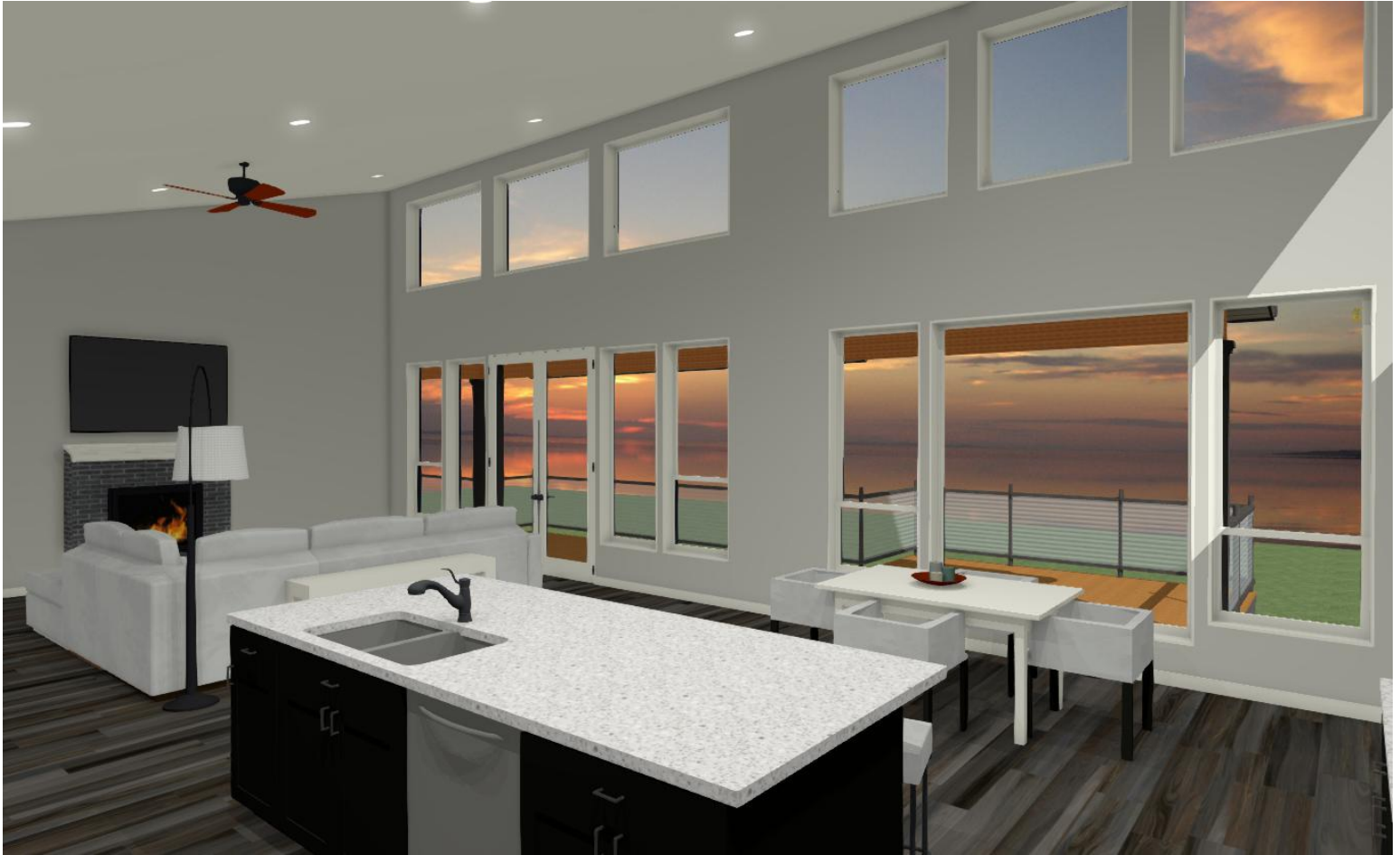
REAR VIEW FROM KITCHEN