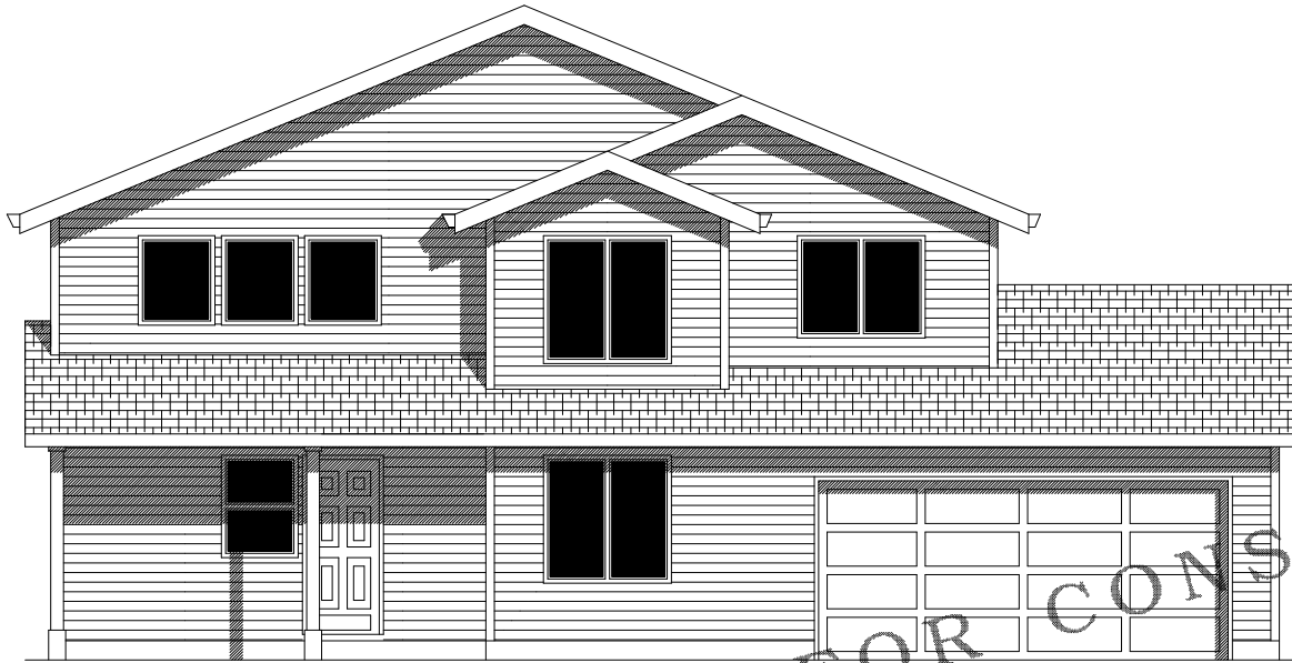
FRONT ELEVATION-B SCALE 1/4"=1'-0"