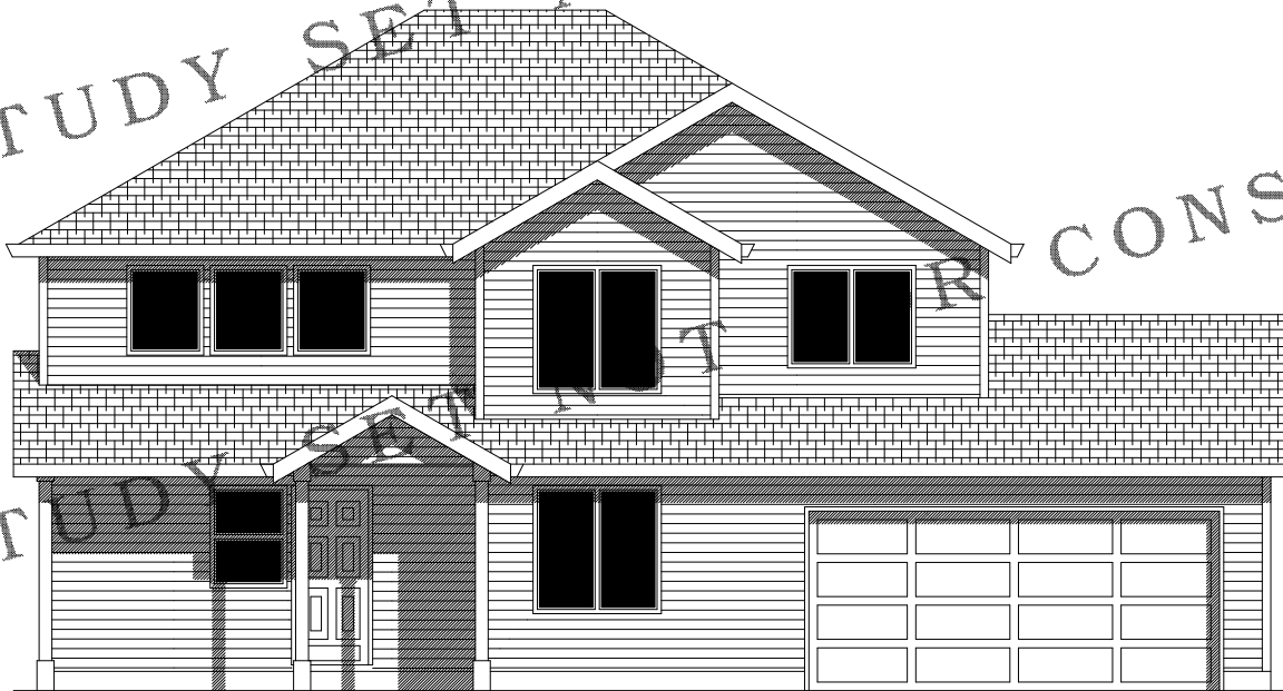
FRONT ELEVATION-A SCALE 1/4"=1'-0"