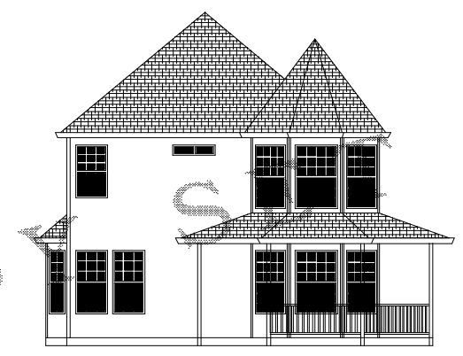
LEFT SIDE ELEVATION SCALE 1/8"=1'-0"