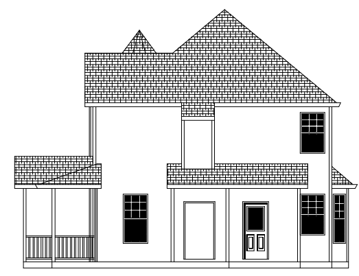
RIGHT SIDE ELEVATION SCALE 1/8"=1'-0"