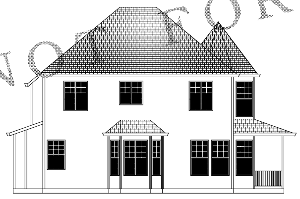
REAR ELEVATION SCALE 1/8"=1'-0"