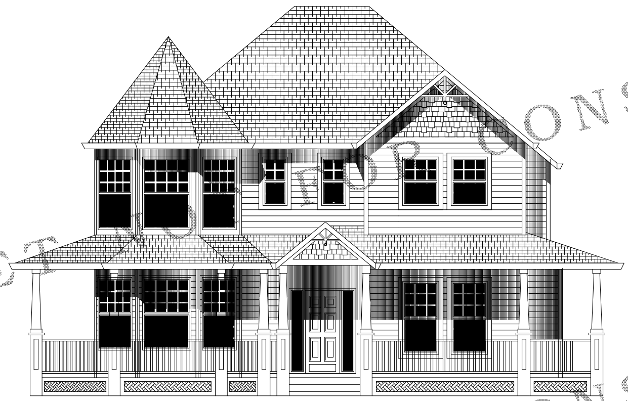
FRONT ELEVATION SCALE 1/4"=1'-0"